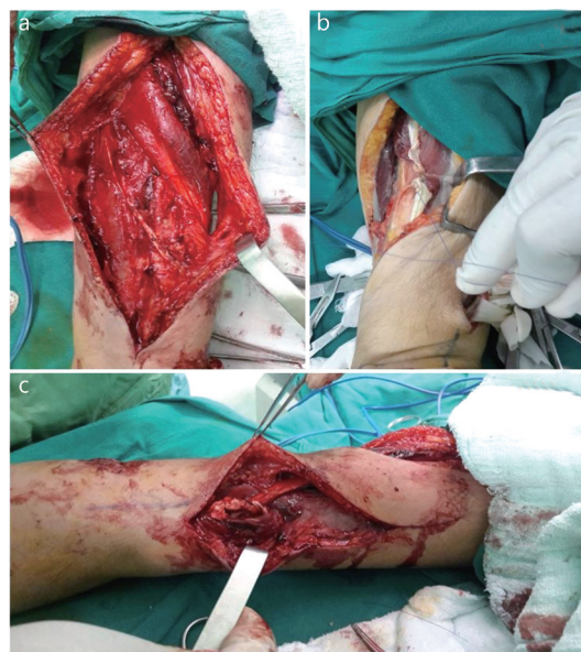
Fig. 1 The palmaris longus tendon was used for transfer to the extensor pollicis longus for thumb extension, as shown in (a). The pronator teres was transferred to the extensor carpi radialis brevis for wrist extension, as shown in (b). The flexor carpi radialis was transferred to the extensor digiti communis for 2nd, 3rd, 4th, and 5th finger extension, as shown in (c)

The tendons were cut distally at the wrist and freed from the musculotendinous junction proximally after the tendons of the fCU and fCR were released via longitudinal forearm incisions. The tendons were tunneled along the radial and ulnar borders of the forearm subcutaneously. Under high tension, the tendon was sutured to the eCRB tendon with the wrist extended. The fCU was joined with the abductor pollicis longus (APL), extensor pollicis longus (ePL), eDC, and extensor indices proprius (eIP). After wrist extension under tension, the fCU was connected to the eDC and eIP, which are the finger