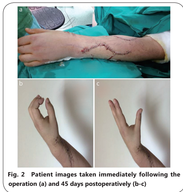
Fig. 2 Patient images taken immediately following the operation (a) and 45 days postoperatively (b-c)

FE. Finger extension; WE. Wrist extension; WF. Wrist flexion; TM. Thumb movement